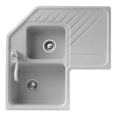
L-shaped solid surface sink unit for a corner situation – by Carron