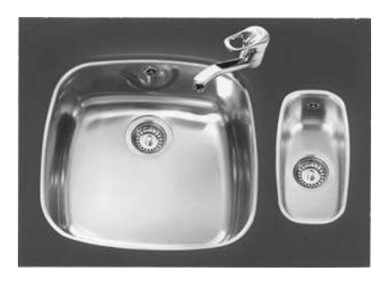
Under-mounted sink bowls - by Carron