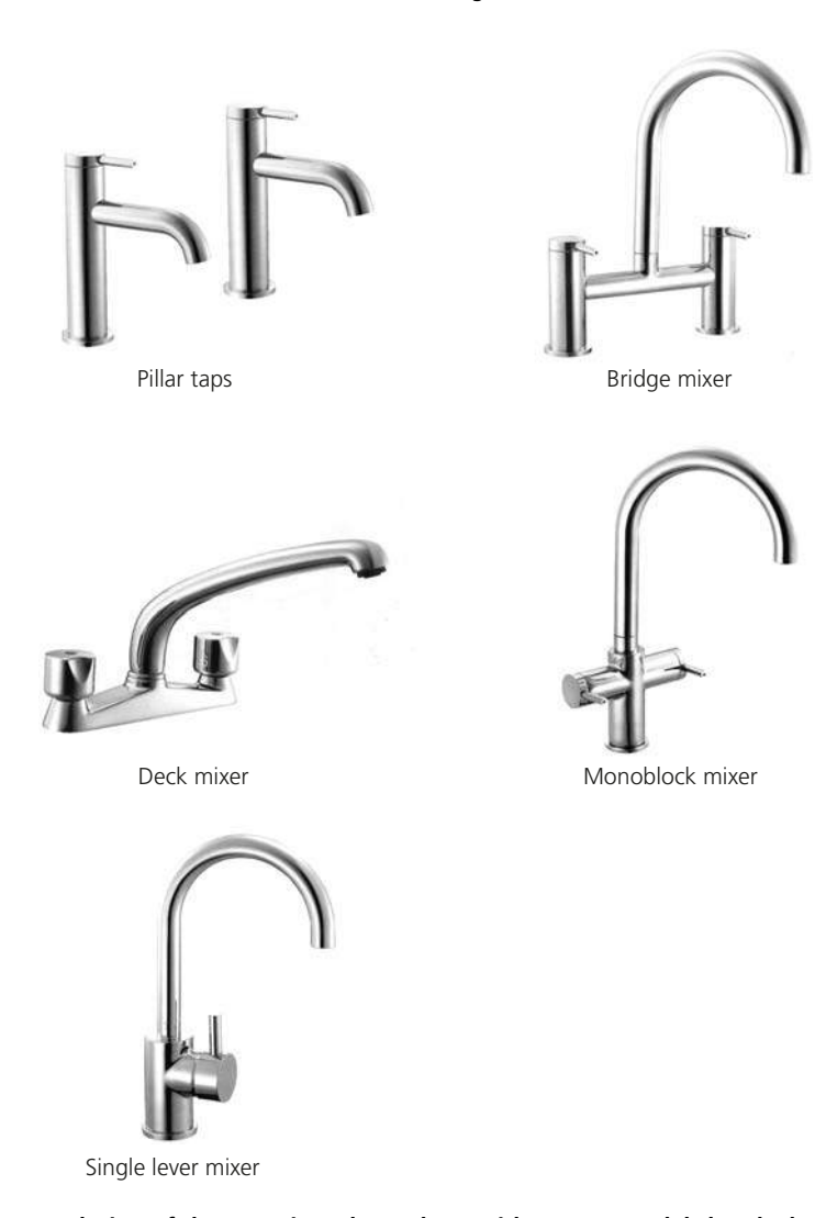
Evolution of the tap mixer shown here with current models by Ideal Standard