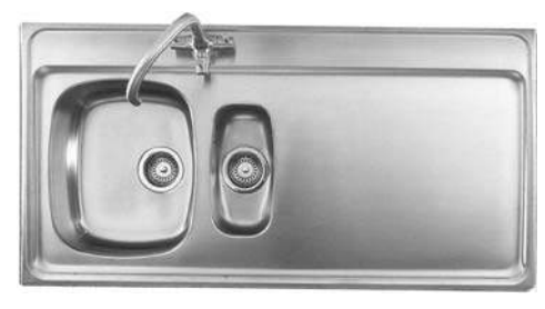
Sit-on SS sink unit - by Carron